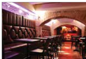
Restaurants / Pubs